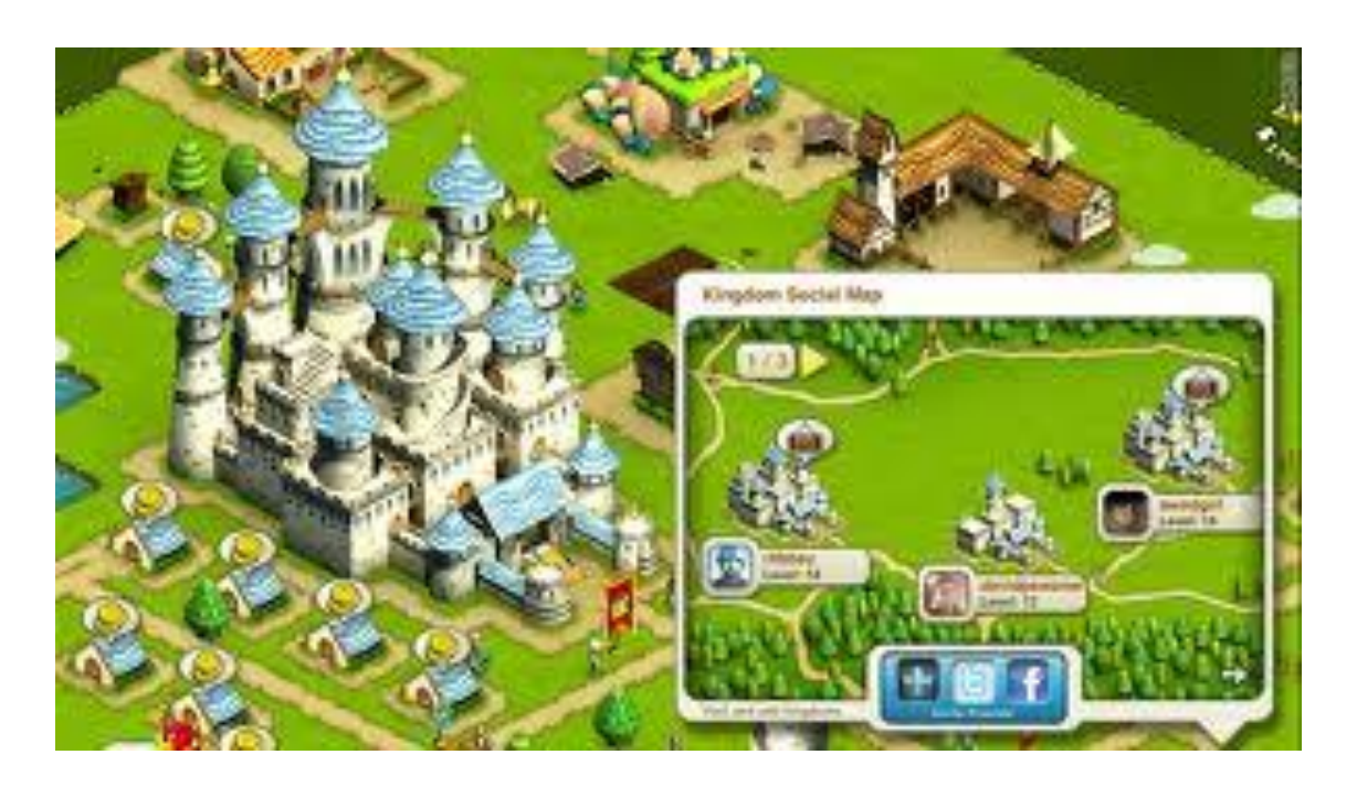
Social Site Gaming Guru

Ever since social sites were introduced to the public, many people became a fan of various social site games. In fact, millions of social site users are also taking advantage of the social site games that are made to provide fun and entertainment. If you are a social site gamer, there are several things that you need to know about social gaming. In this book, you will learn some known social site games and you will find out what it takes to be a hero in the world of social site gaming.